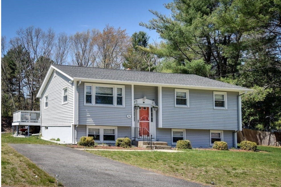
36 Christopher Rd Sale Price = 550,000