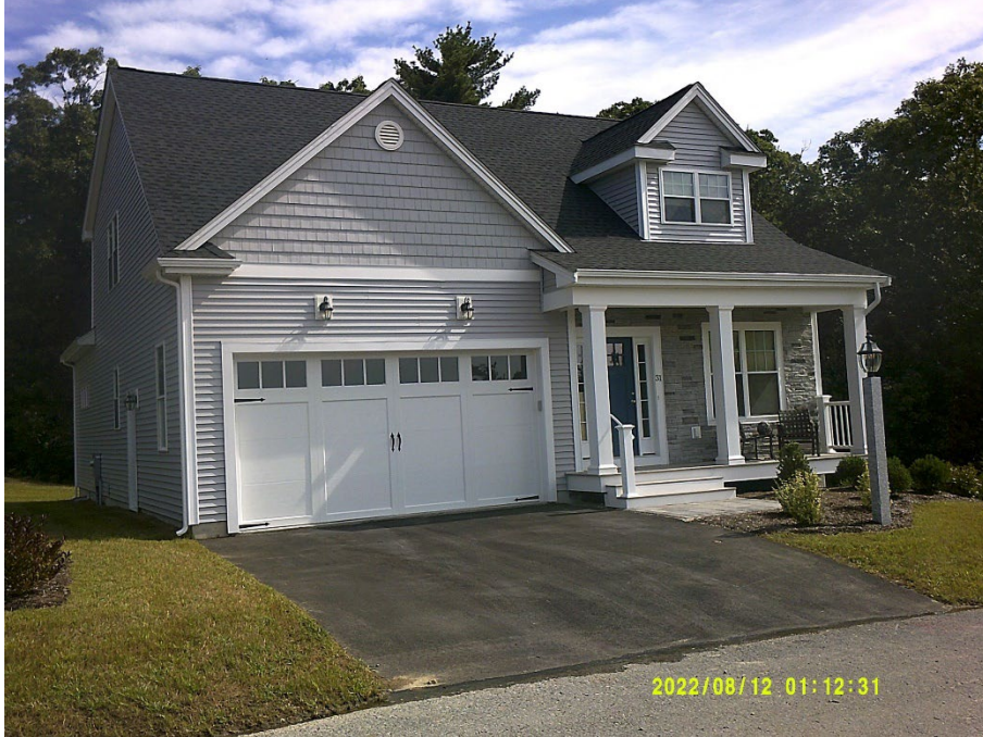
31 Bittersweet Circle Sale Price = 780,000