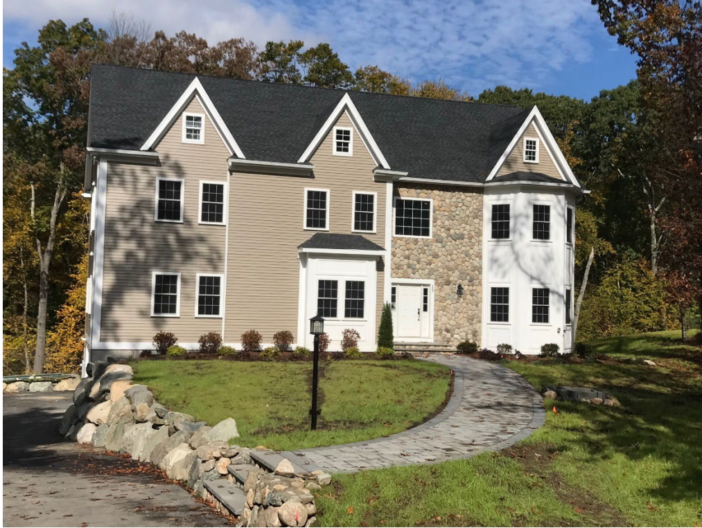
15 Anna Place Sale Price 1,325,000