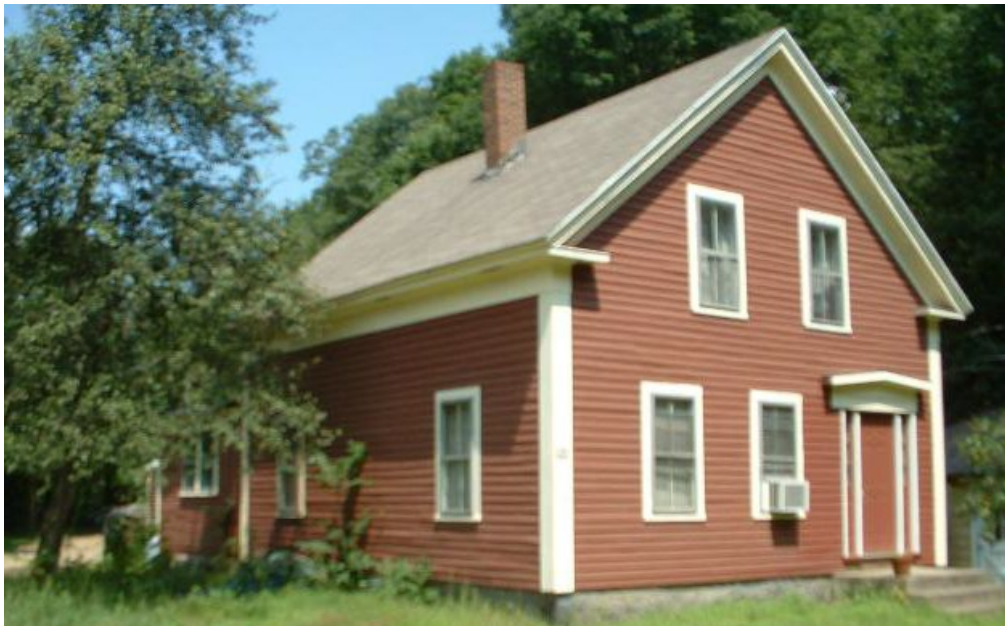
219 Woodland St Sale Price = 640,000