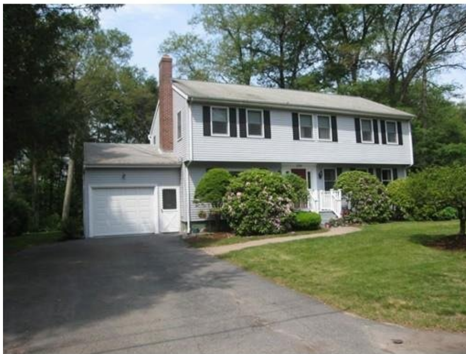
270 Marked Tree Rd Sale Price = 850,000