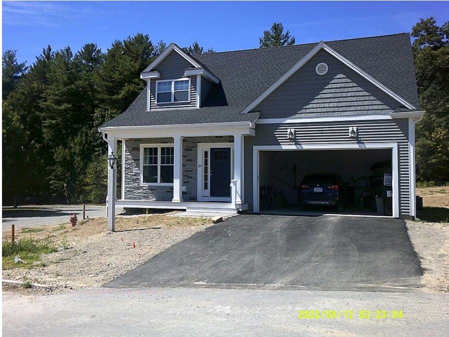
59 Bittersweet Circle Sale Price = 780,700