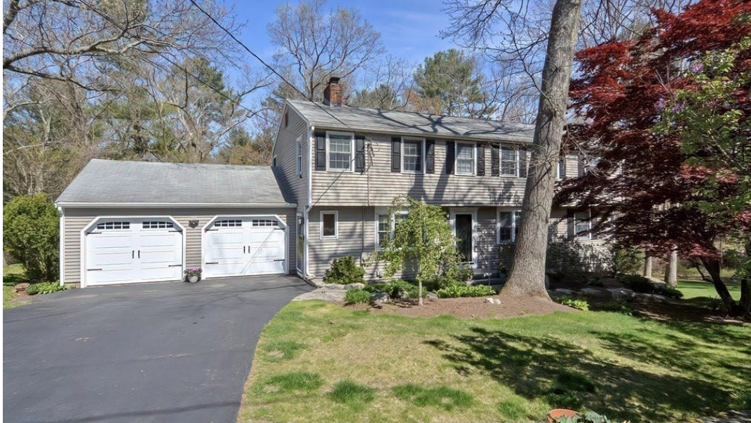
348 Marshall St Sale Price = 795,000