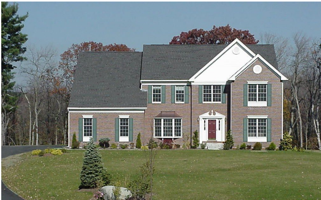
66 Fairview St Sale Price 1,060,000