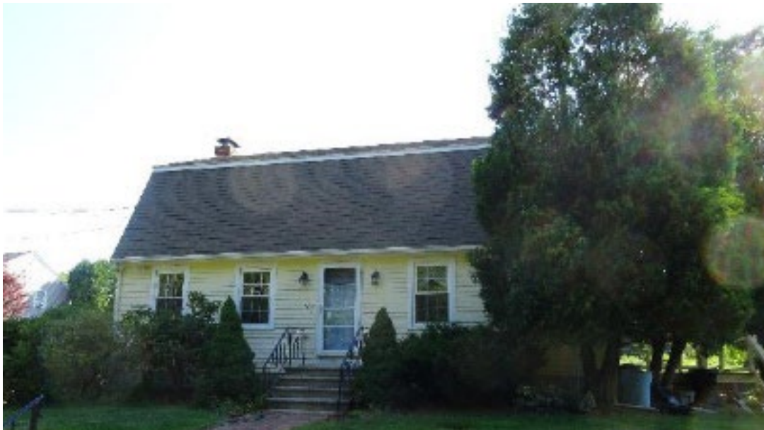
634 Norfolk St Sale Price = 501,900