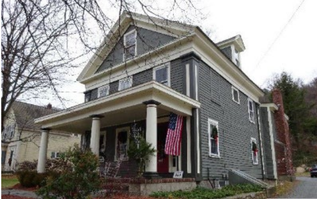
645 Washington St Sale Price = 750,000