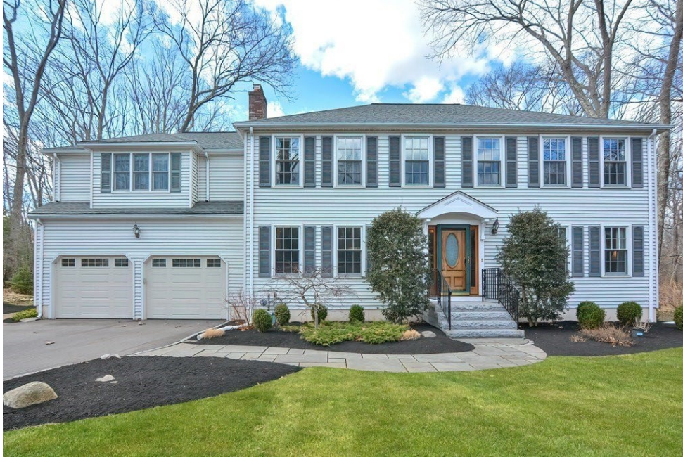
141 Dalton Rd Sale Price = 911,000