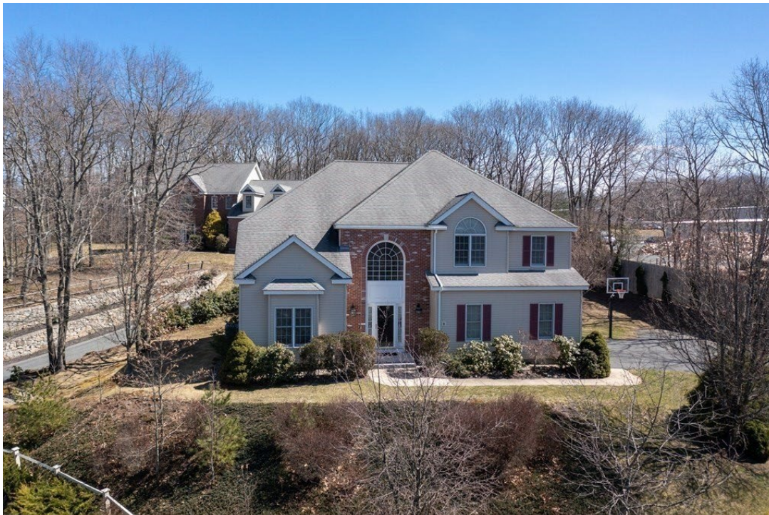
11 Old Cart Path Sale Price = 902,000