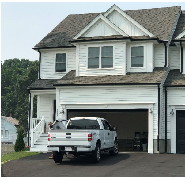
1093 Washington St Sale Price = 585,000