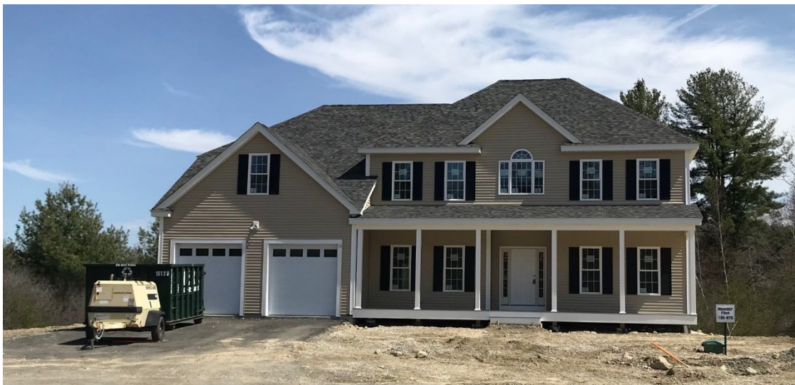
12 Pout Ln Sale Price = 987.300