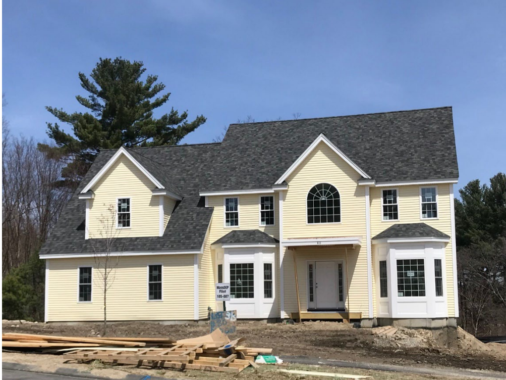
80 Old Cart Pth Sale Price = 873,000