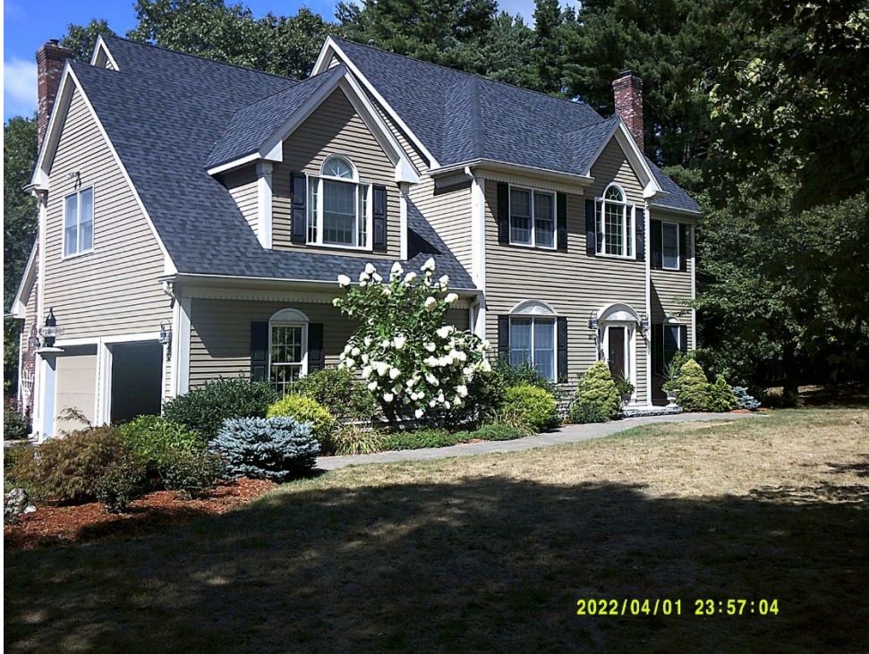
30 Morgan's Way Sale Price = 1,000,000