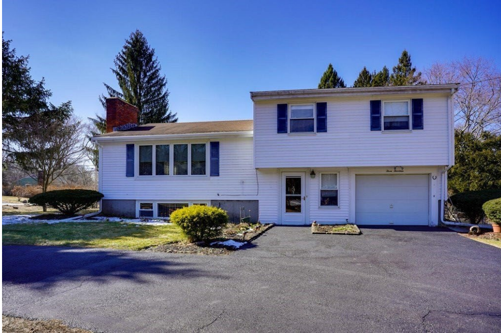
314 Highland St Sale Price = 485,000