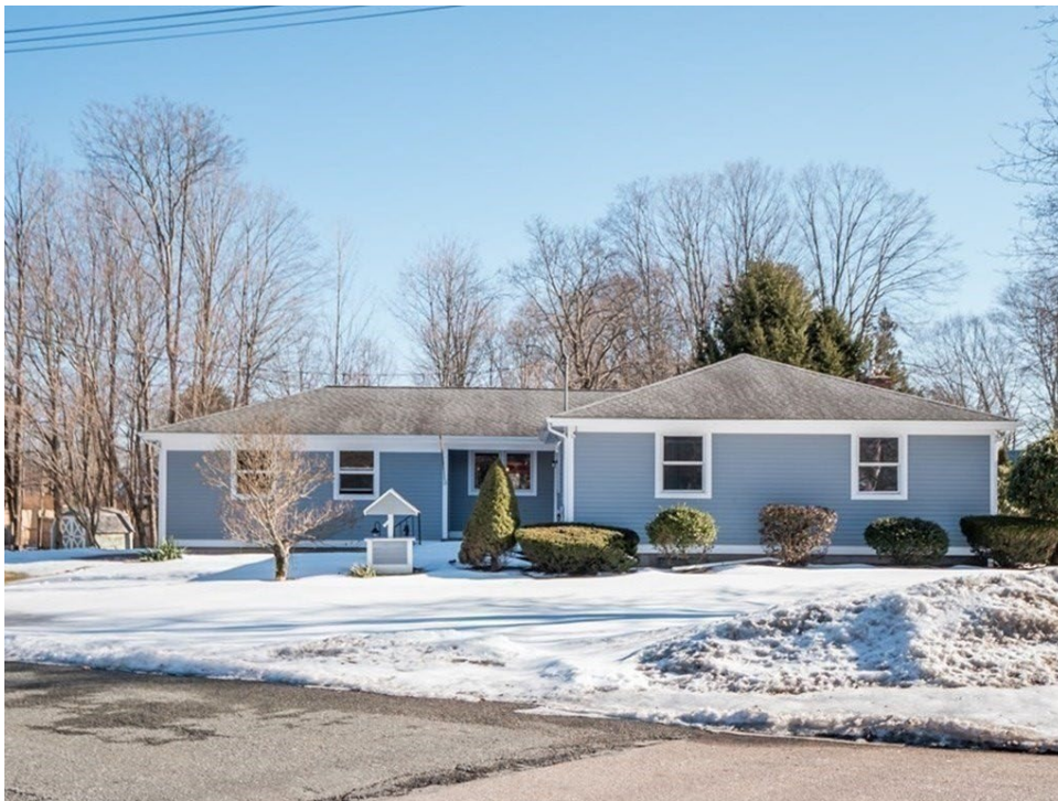
80 Baker St Sale Price = 617,000