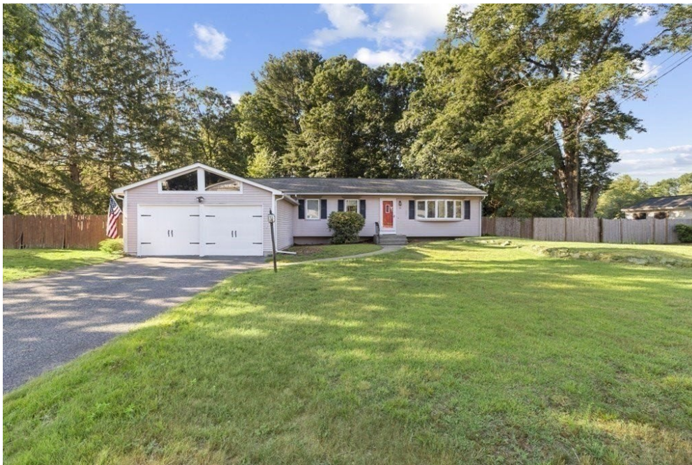
56 Dean Rd Sale Price = 579,900