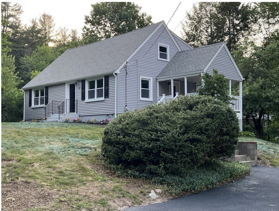
20 Maple St Sale Price = 590,000