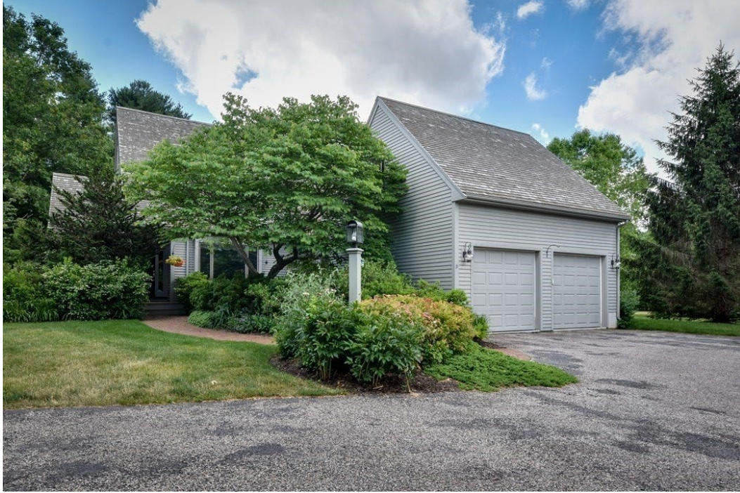
9 Fiske Pond Rd Sale Price = 1,115,000