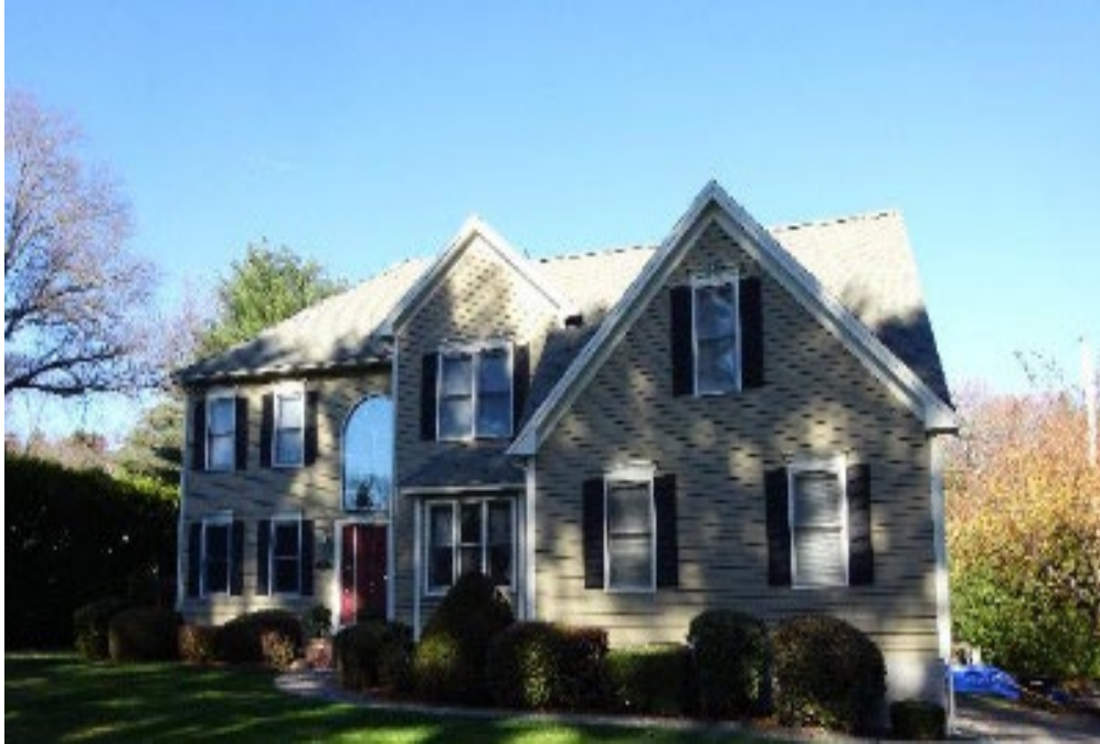
110 Goulding St Sale Price = 916,000