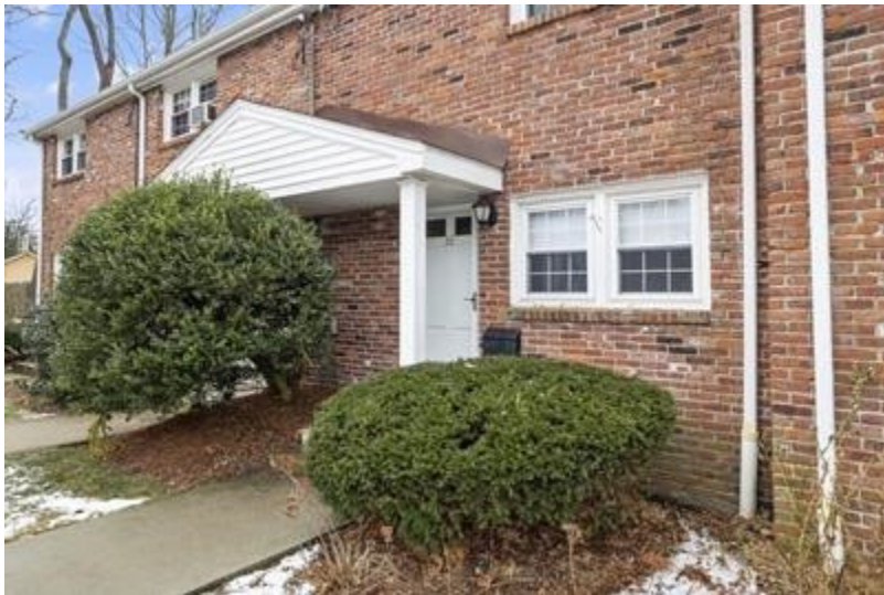
33 Regency Dr U-33 Sale Price = 270,000