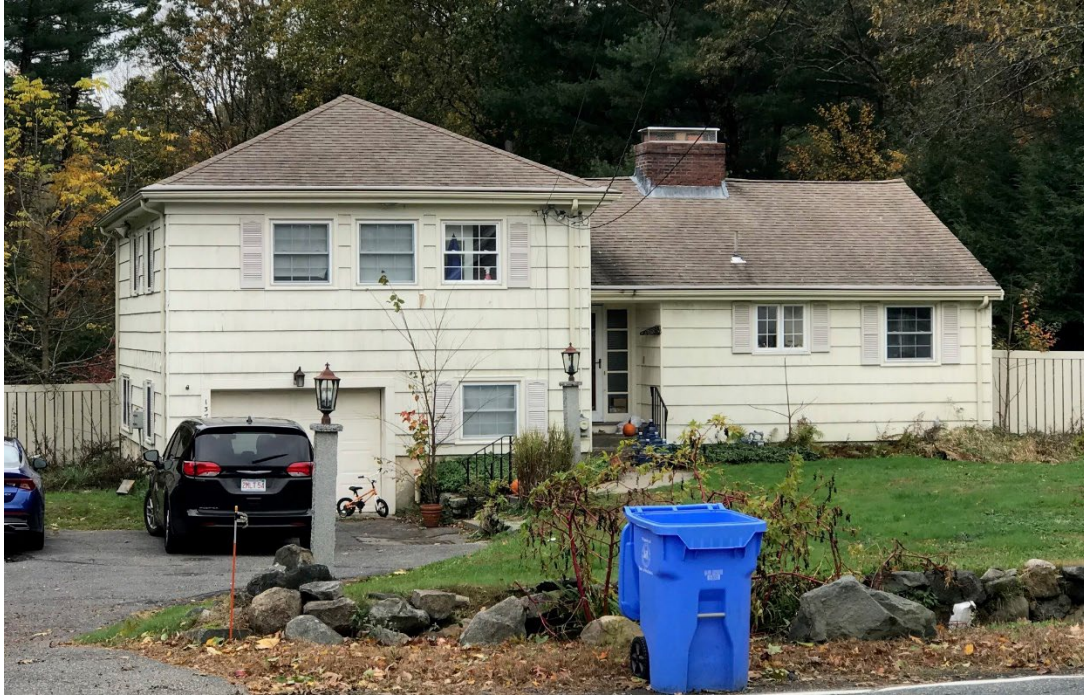
1373 Highland St Sale Price = 585,000