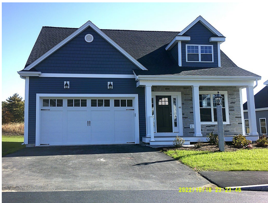
48 Bittersweet Circle Sale Price = 773,300