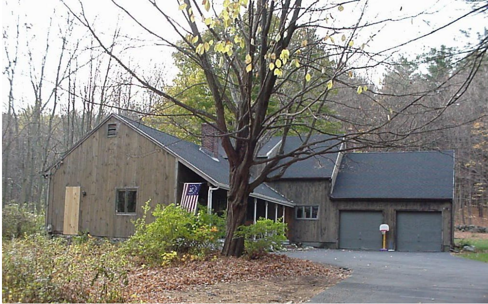
511 Washington St Sale Price = 580,000