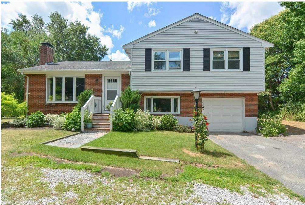
541 Norfolk St Sale Price = 525,000