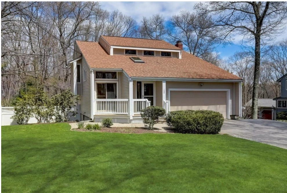
199 Cedar St Sale Price = 744,000