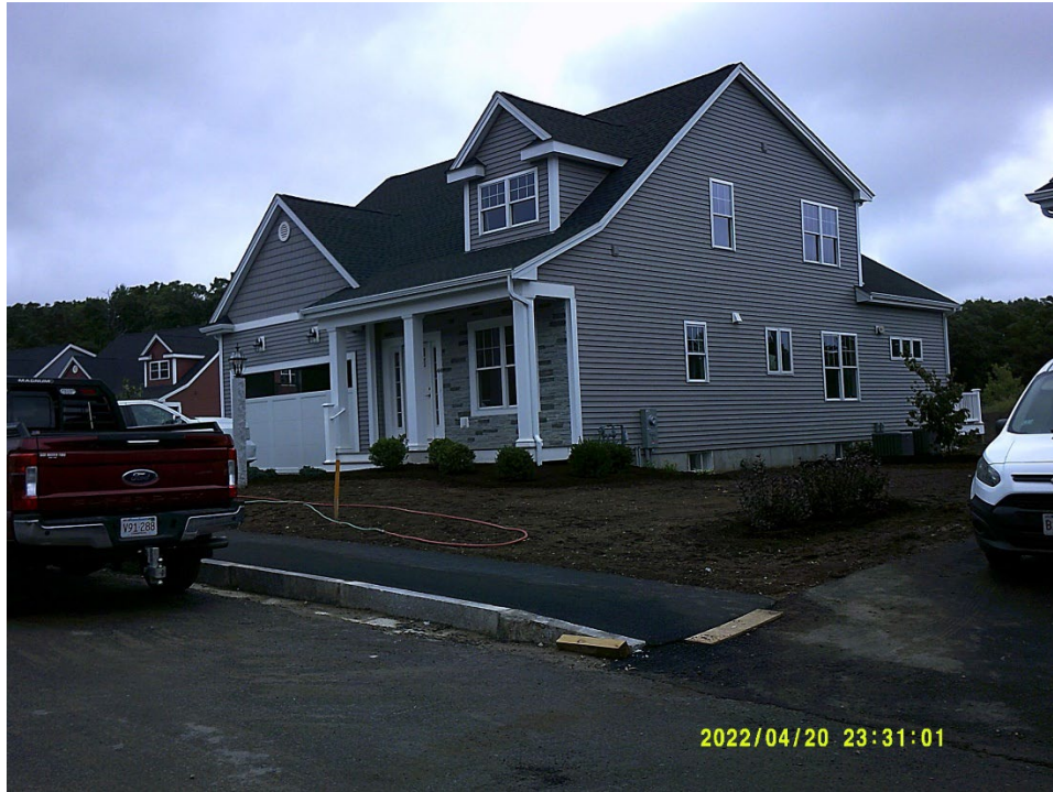
44 Bittersweet Circle Sale Price = 835,000