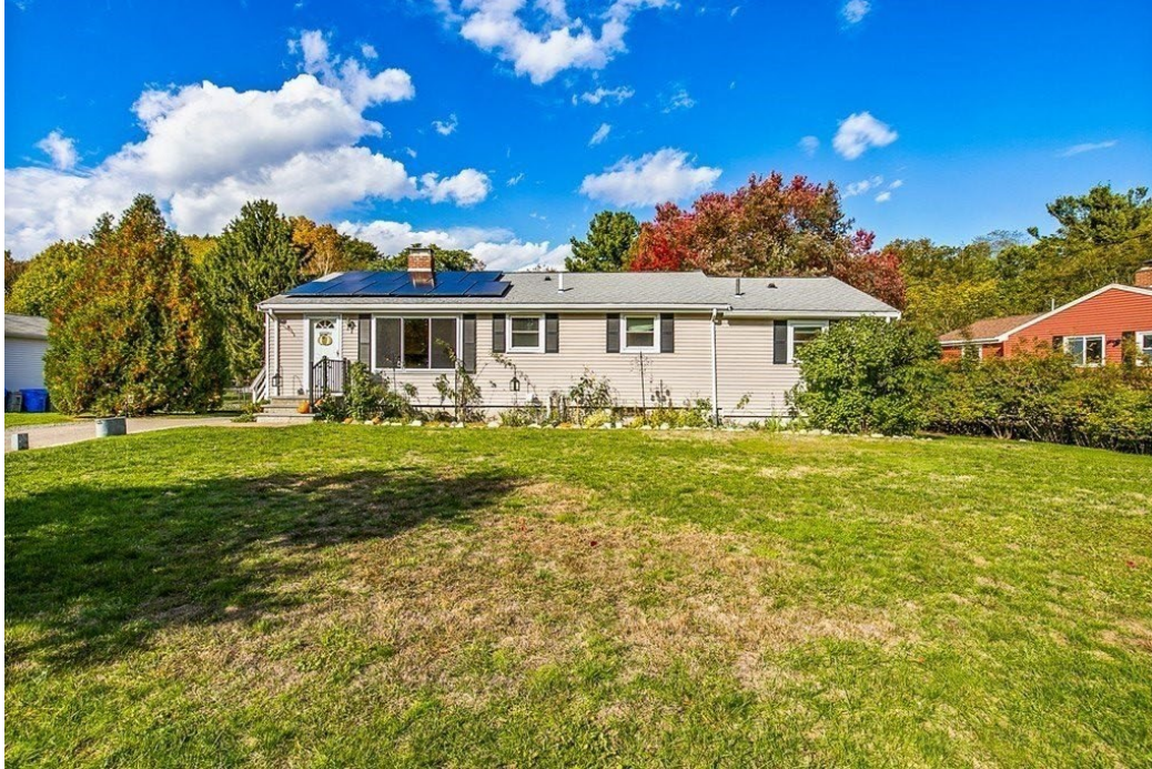
66 Wedgewood Dr Sale Price = 510,000