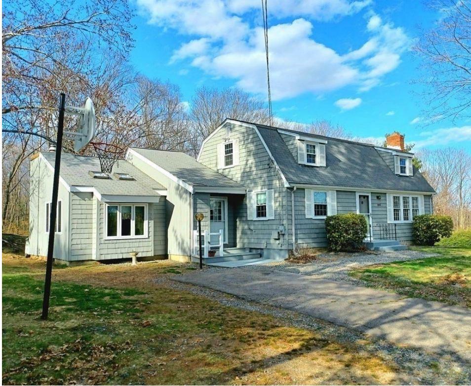
195 Turner Rd Sale Price = 519,900