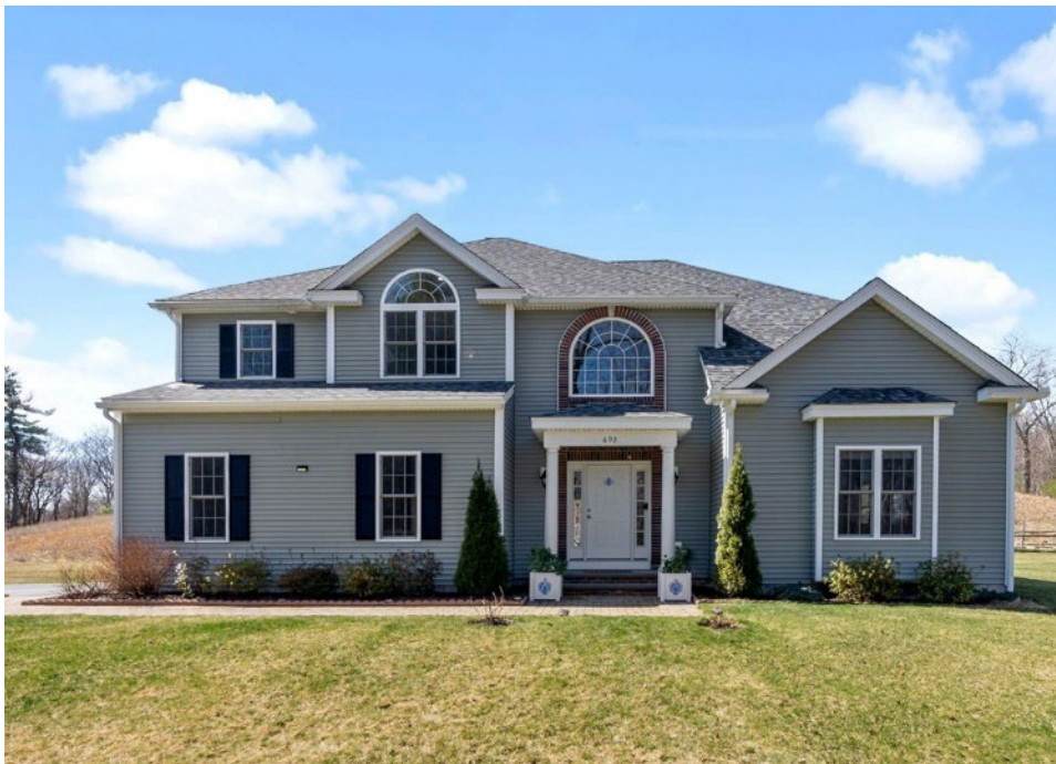
692 Concord St Sale Price = 1,040,000