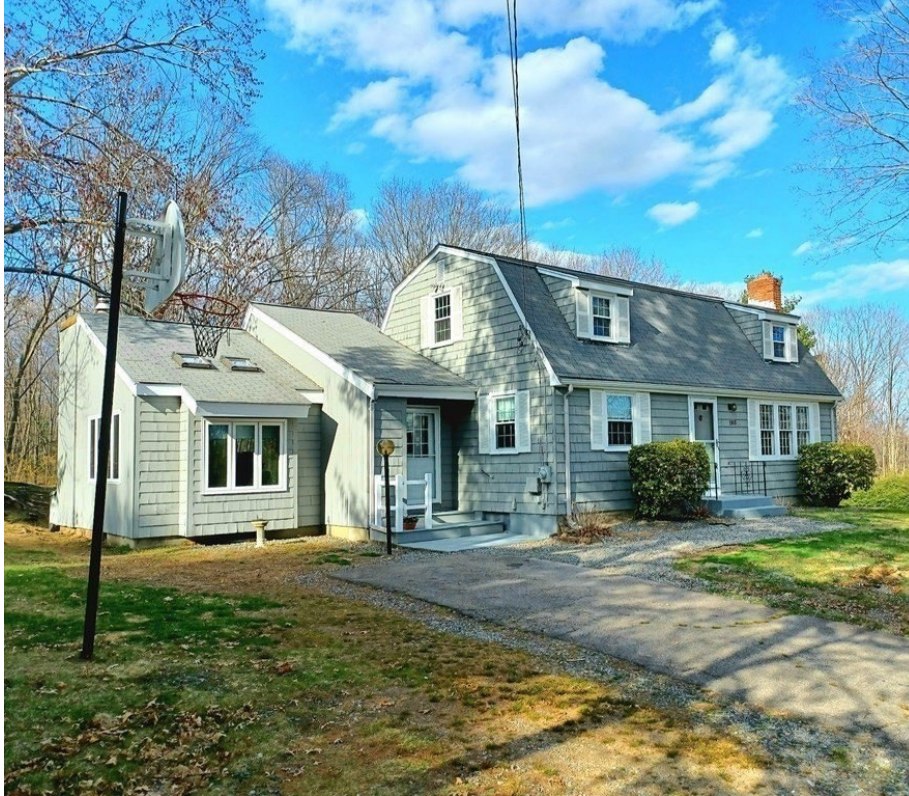
195 Turner Rd Sale Price = 519,900