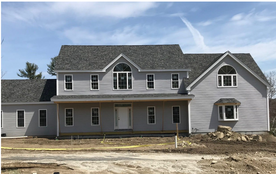
84 Old Cart Path Sale Price = 939,100