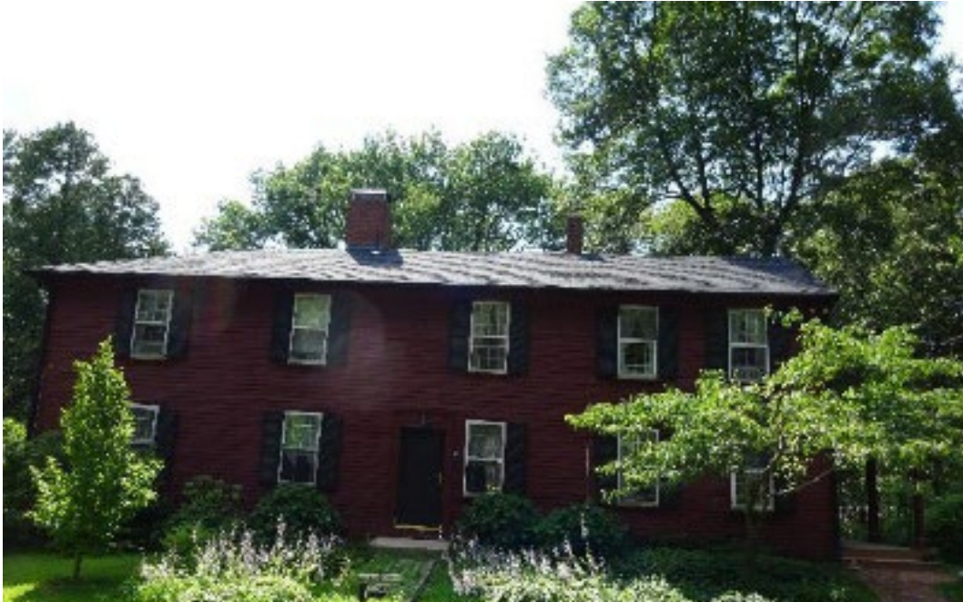
413 Underwood St Sale Price = 750,000