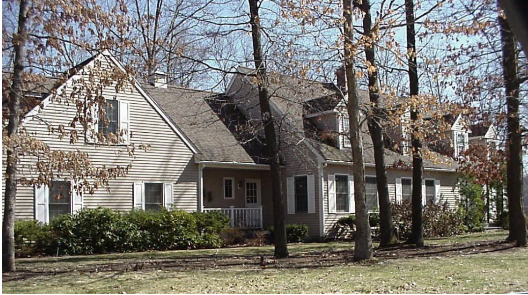
230 Willow Gate Rise Sale Price = 950,000