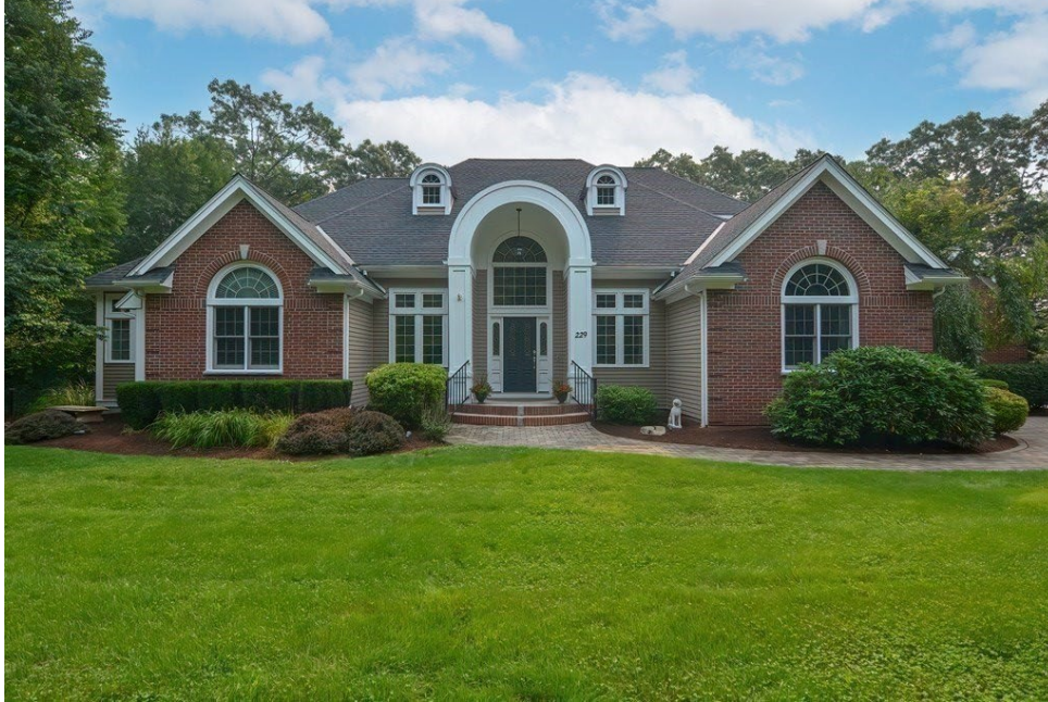
229 Underwood St Sale Price = 1,420,000