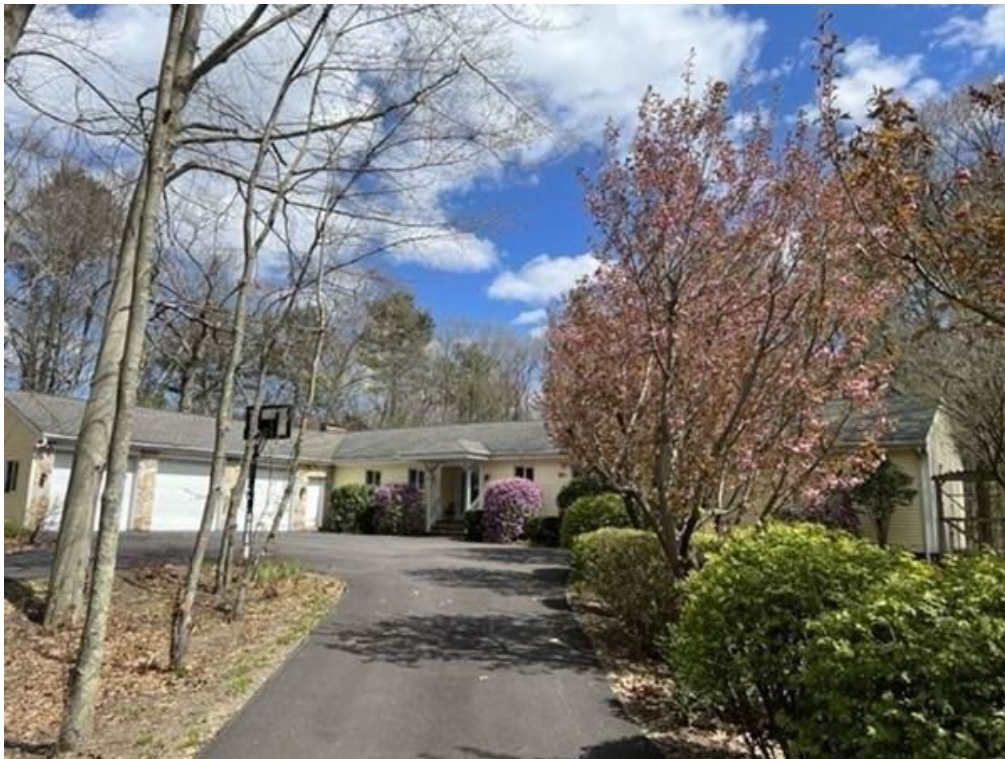
425 Underwood St Sale Price = 860,000