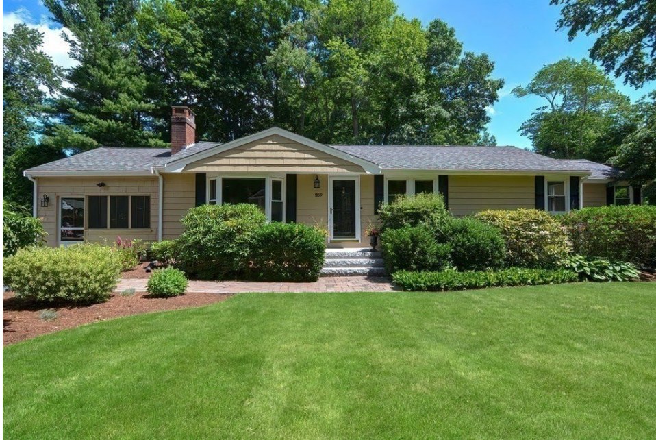
259 Marked Tree Rd Sale Price = 652,500