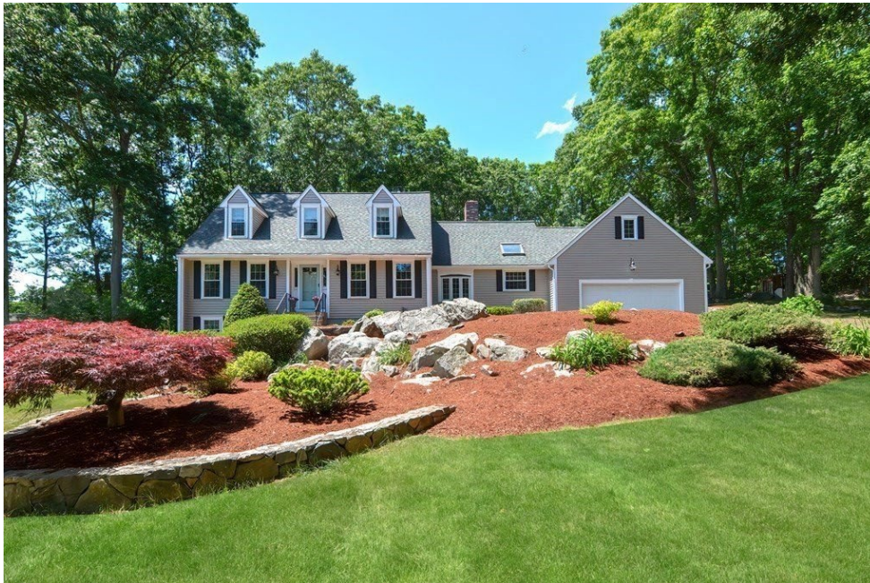
201 Willow Gate Rise Sale Price = 862,000