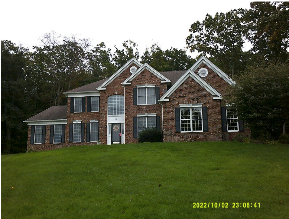
15 Partridge Way Sale Price = 988,000