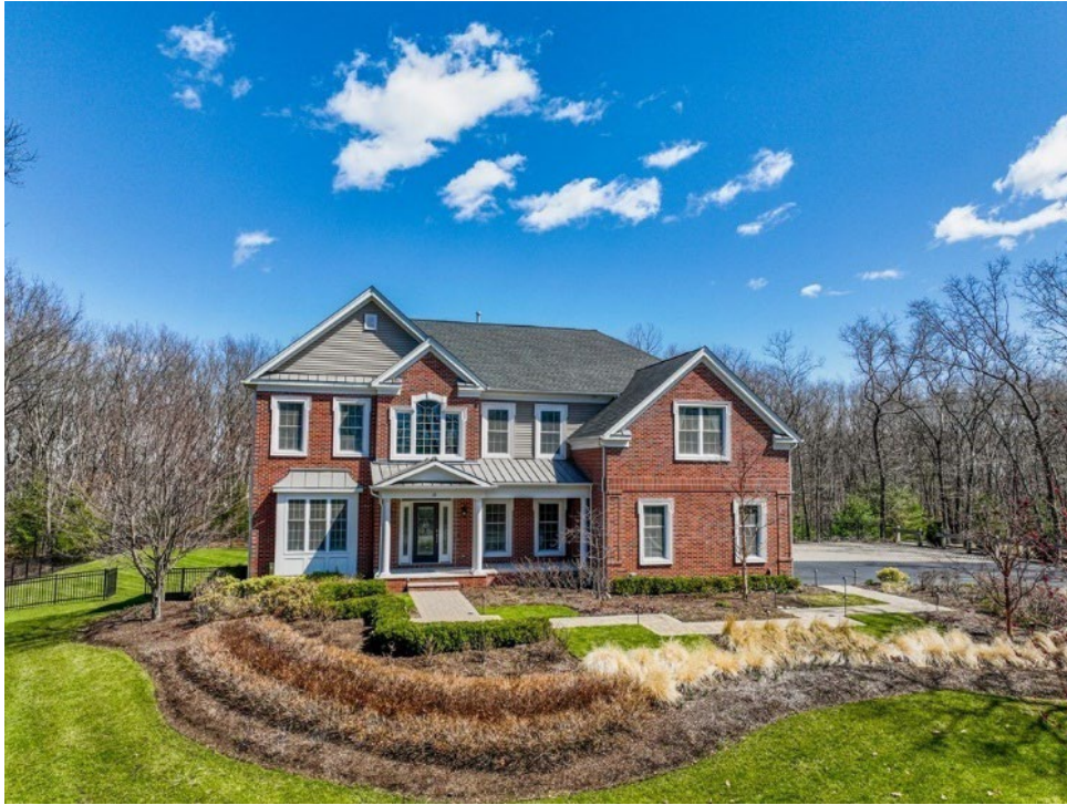
32 Praying Indian Way Sale Price = 1,650,000