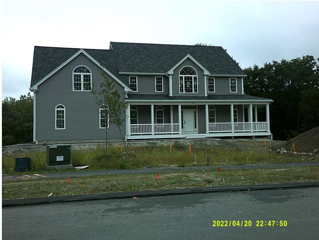
96 Old Cart Path Sale Price = 963,015