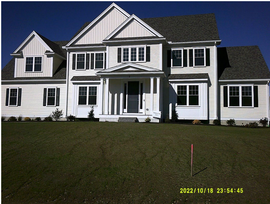
3 Rebeca Ln Sale Price = 1,250,000