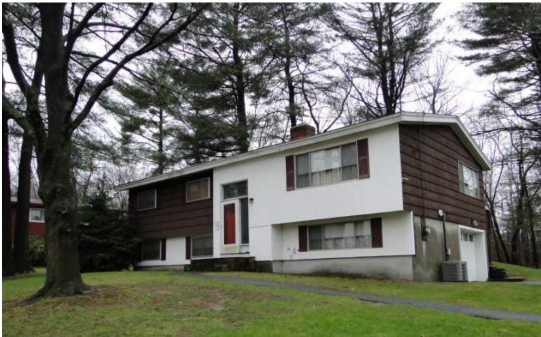
17 Oakridge Rd Sale Price = 400,000