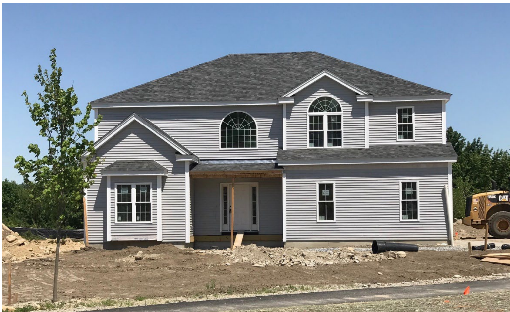
92 Old Cart Path Sale Price = 867,160