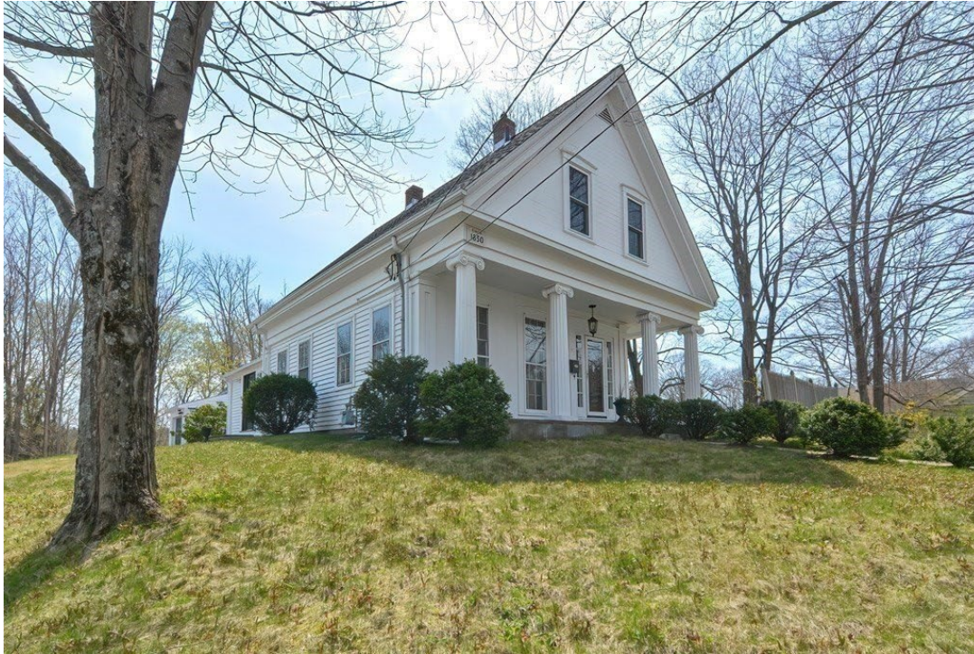
644 Washington St Sale Price = 640,000