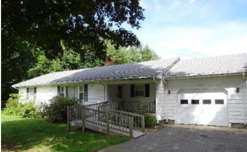
1881 Washington St Sale Price = 510,000