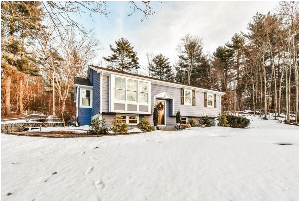
61 Louis St Sale Price = 845,000