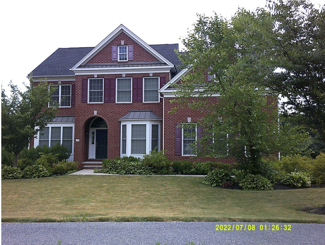
129 Mohawk Path Sale Price = 1,234,567