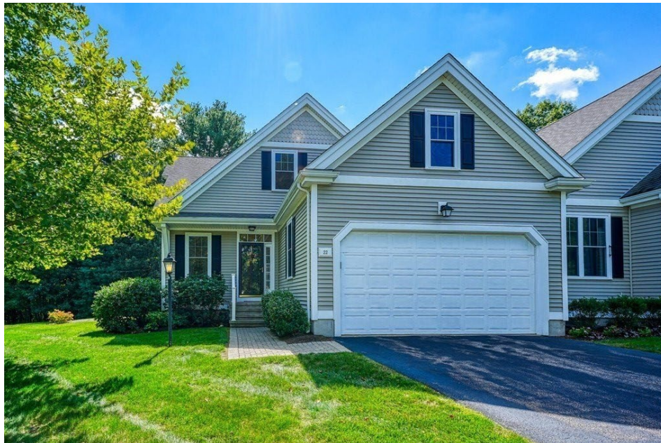
22 Piedmont Dr Sale Price = 653,000