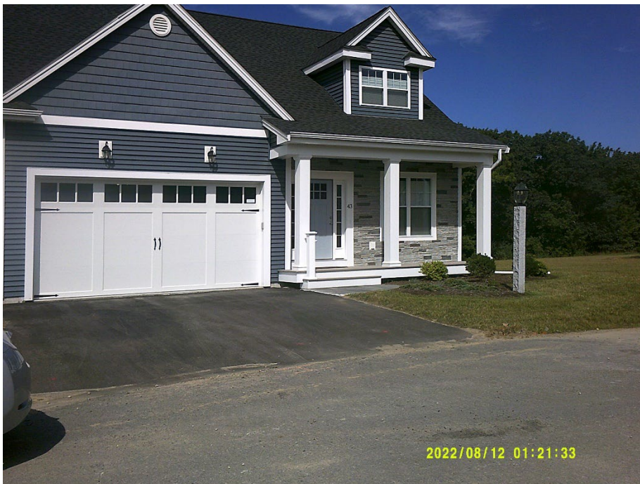
43 Bittersweet Circle Sale Price = 765,000