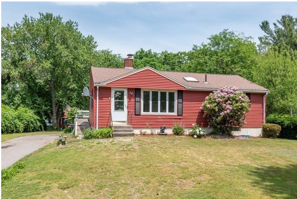
74 Wedgewood Dr Sale Price = 449,000