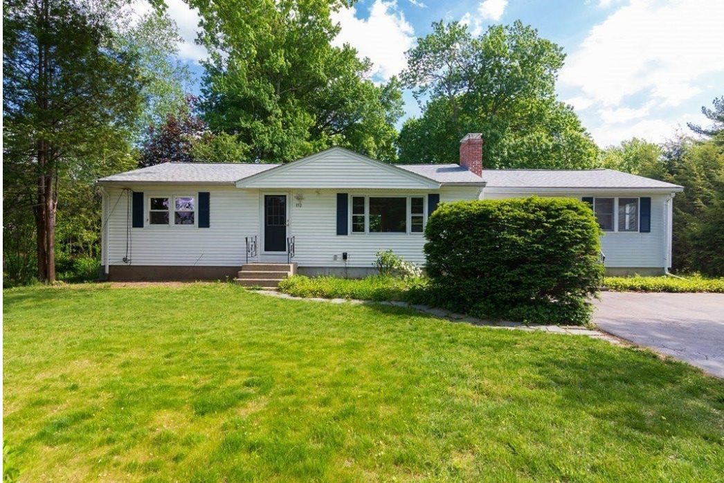
152 Prospect St Sale Price = 500,000