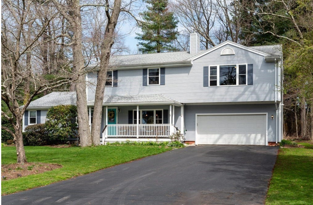
251 Marked Tree Rd Sale Price = 840,000