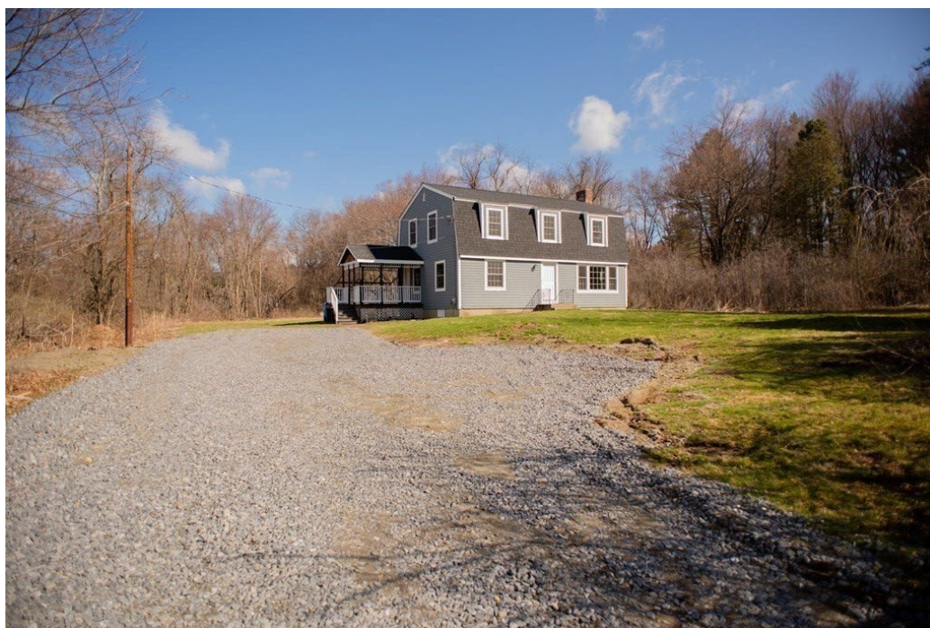
1869 Washington St Sale Price = 602,000