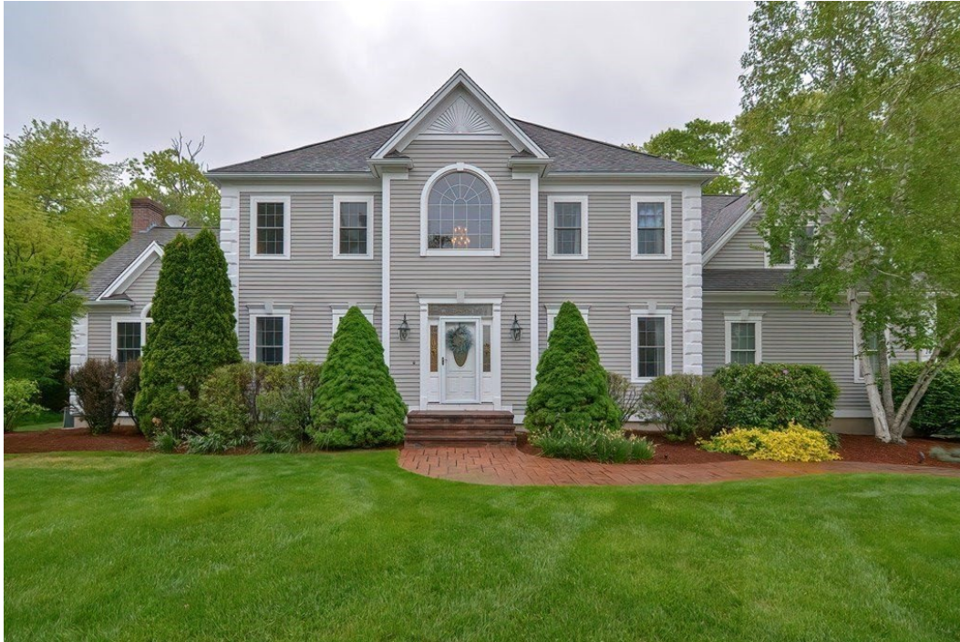
145 Morgan's Way Sale Price = 1,050,000