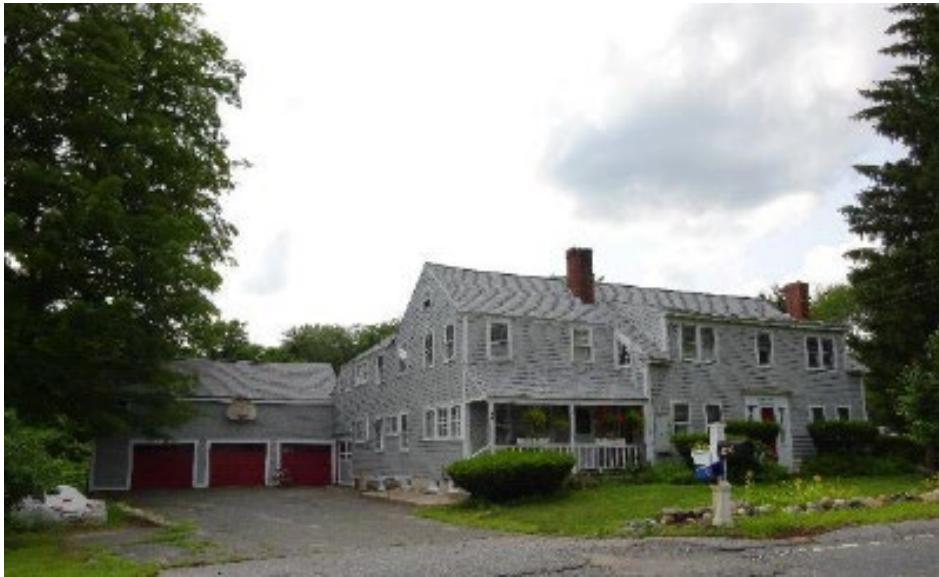
180 Concord St Sale Price 436,000