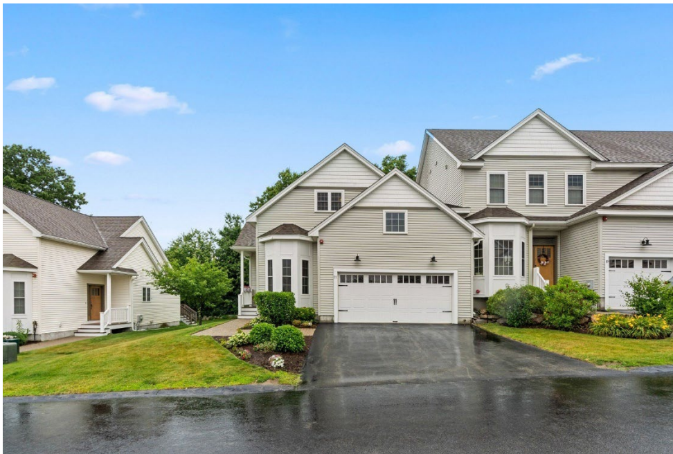
21 Garrett Way Sale Price = 665,000