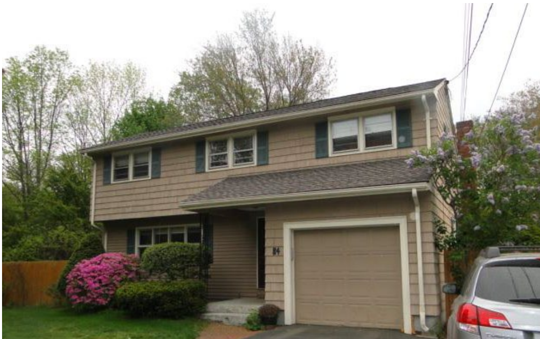
84 Prentice St Sale Price = 610,000