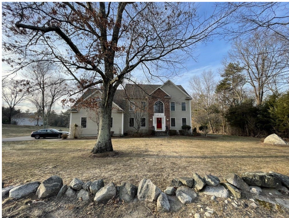
80 Fiske St Sale Price 850,000