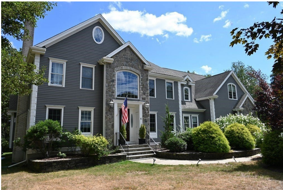
6 Deer Run Sale Price 1,199,000