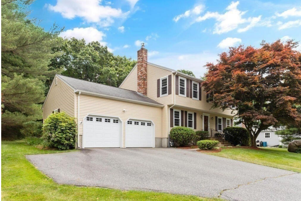
136 Dalton Rd Sale Price = 650,000