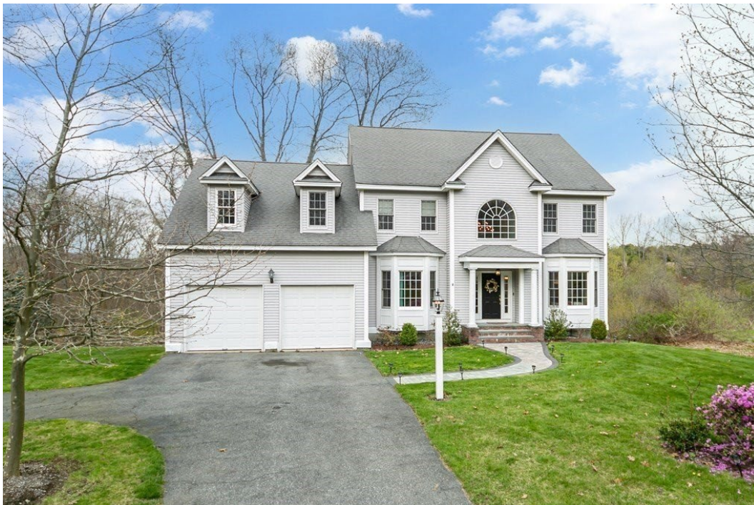
26 Old Cart Path Sale Price = 951,000