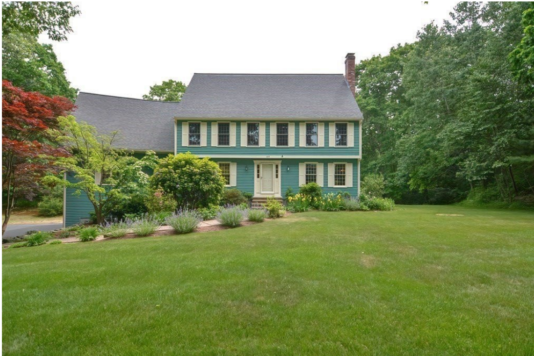
309 Willow Gate Rise Sale Price = 840,000