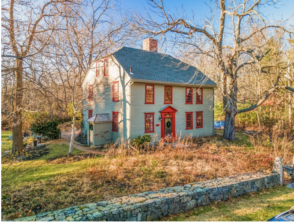
326 Prentice St Sale Price = 560,000