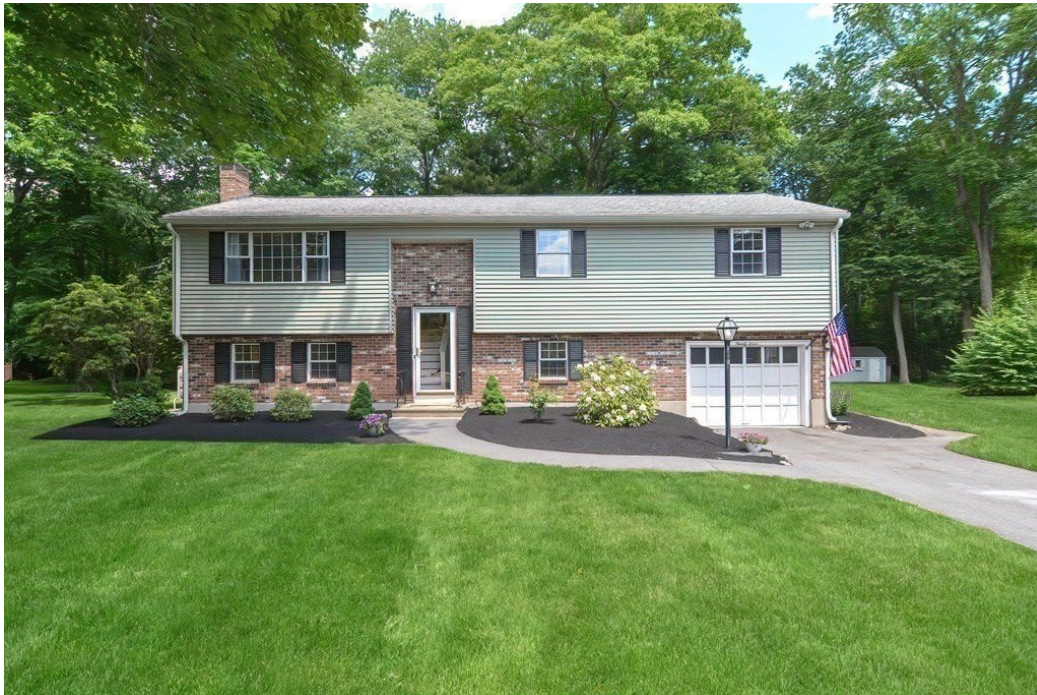
27 Greenview Dr Sale Price = 715,000