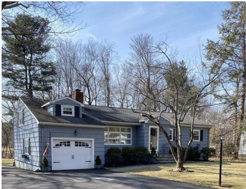
260 Marked Tree Rd Sale Price = 700,000