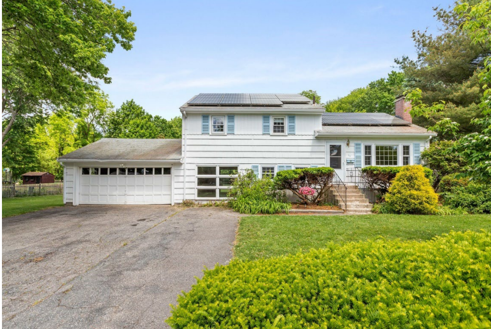
66 Shaw Farm Rd Sale Price = 460,000