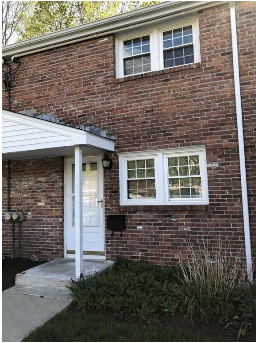
35 Regency Dr U-35 Sale Price = 260,000