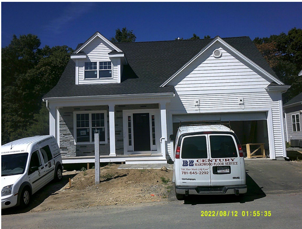
51 Bittersweet Circle Sale Price = 800,500