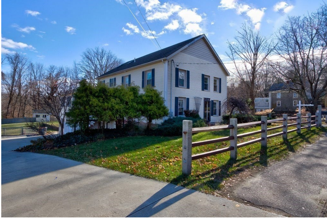
1002 Washington St Sale Price = 665,000