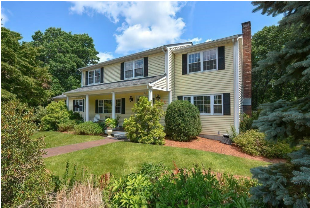
59 Stonybrook Dr Sale Price = 812,000