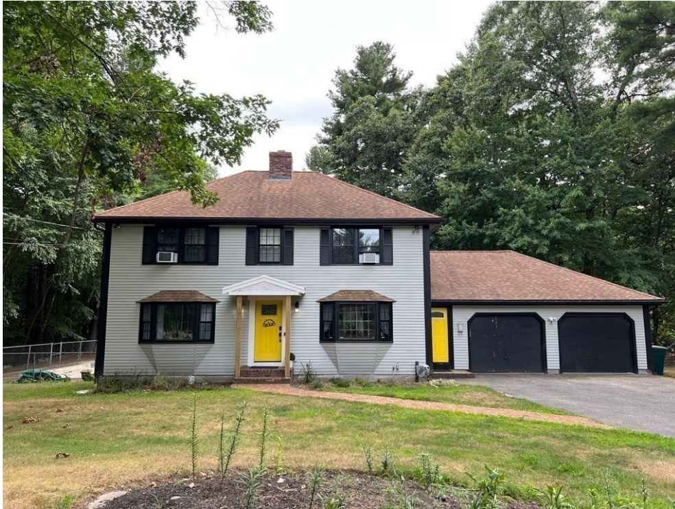
414 Underwood St Sale Price = 780,000