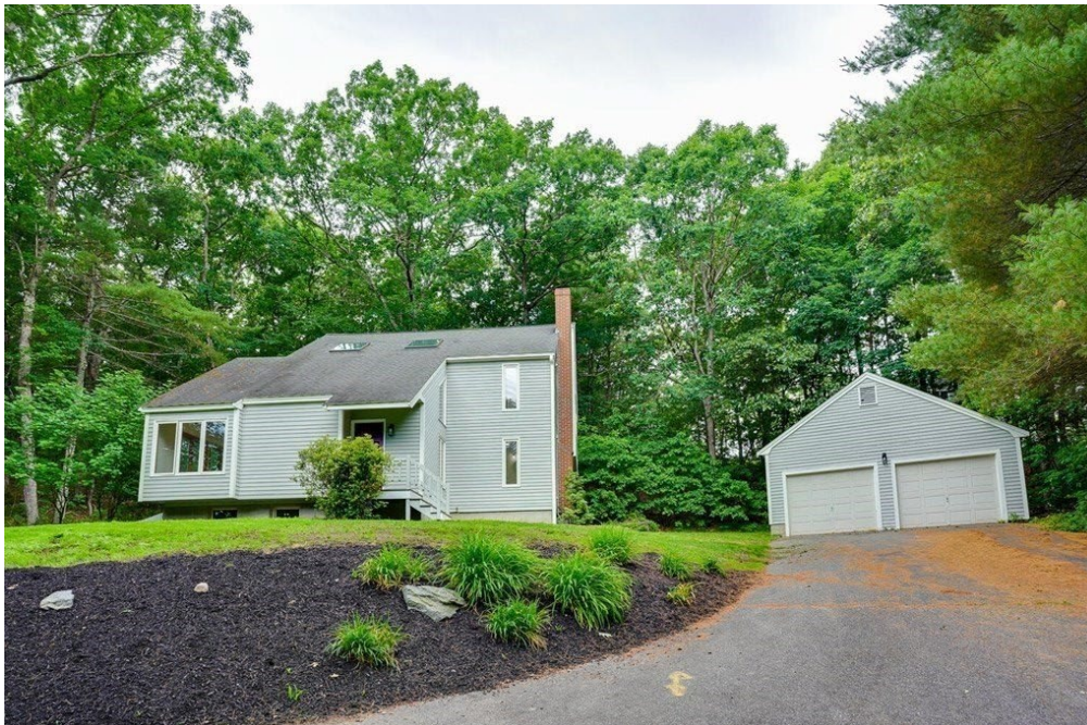
669 Central St Sale Price = 620,000