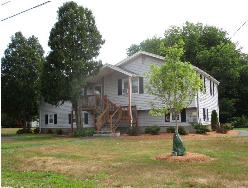
20 Hargrave Ave Sale Price = 815,000