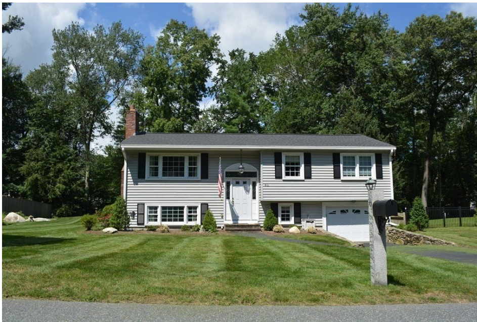
91 Dorset Rd Sale Price = 590,000