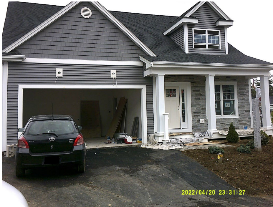
52 Bittersweet Circle Sale Price 903,000