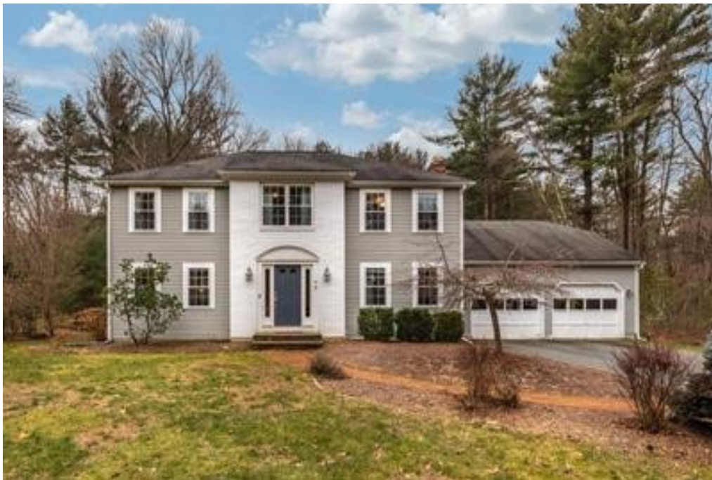
48 Briarcliff Ln Sale Price 835,000