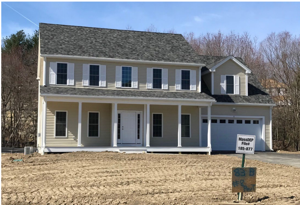
8 Pout Ln Sale Price = 817,450