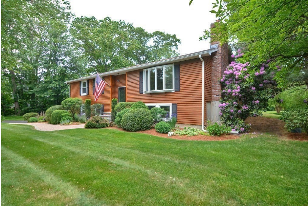
977 Highland St Sale Price = 807,000