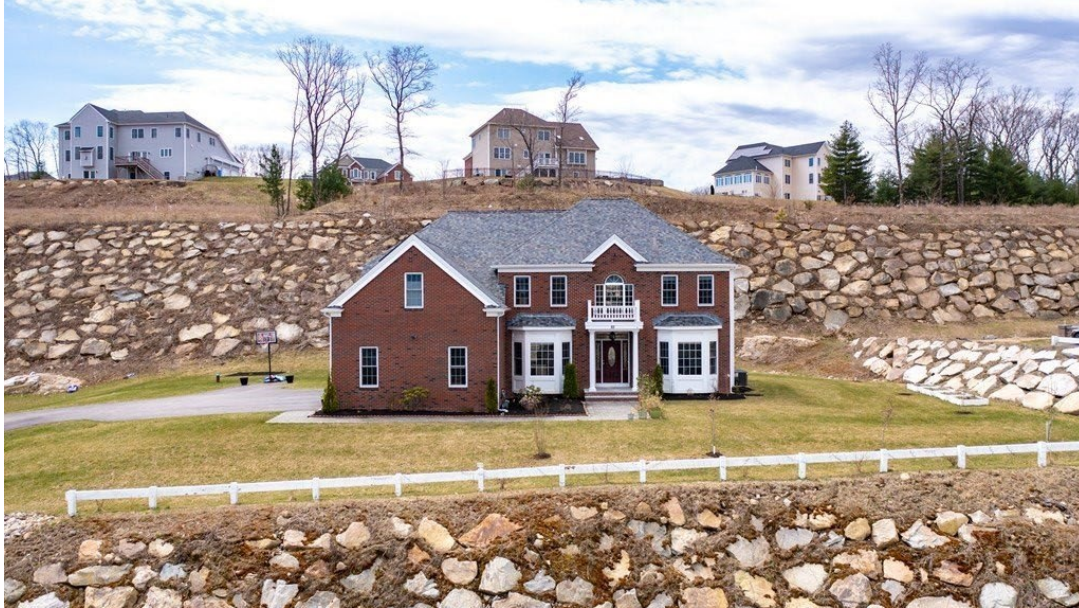
85 Old Cart Path Sale Price = 1,225,000