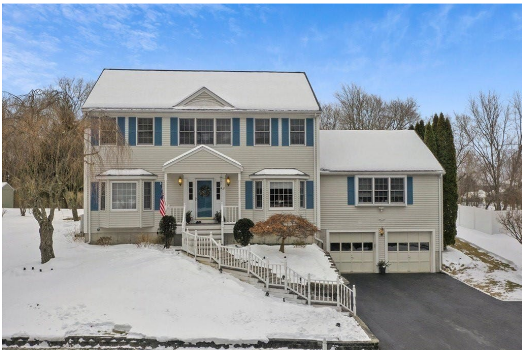
29 Kim Place Sale Price = 936,000