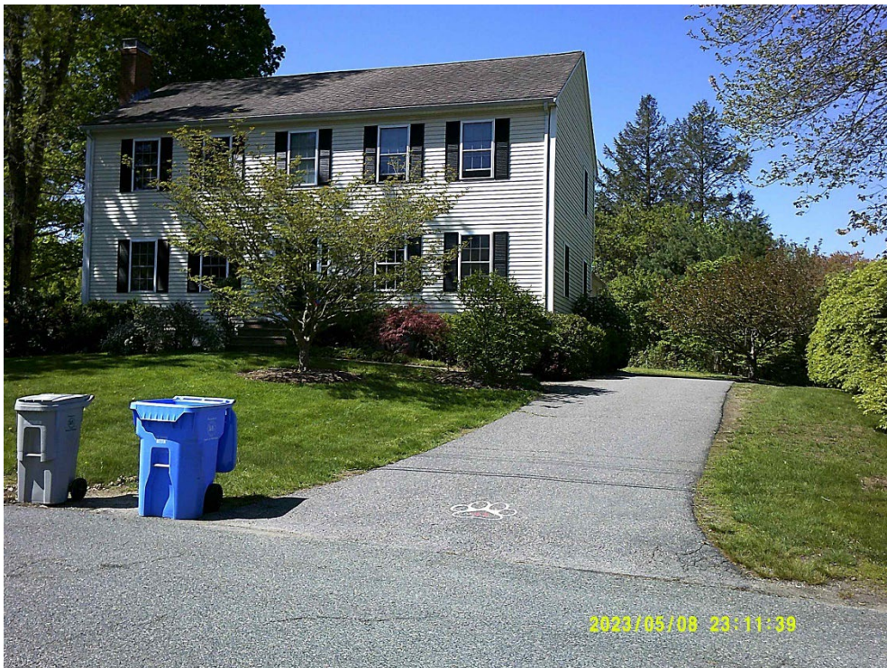
43 Shaw Farm Rd Sale Price = 740,000