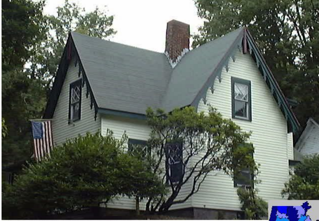
579 Washington St Sale Price = 505,000