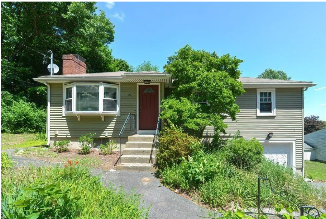
19 Spruce St Sale Price = 500,000