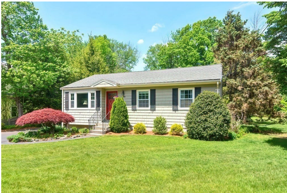
388 Chamberlain St Sale Price = 525,000