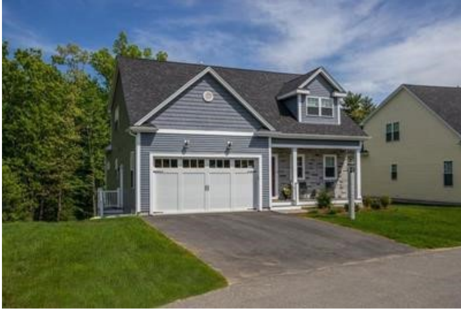
55 Bittersweet Circle Sale Price = 784,900