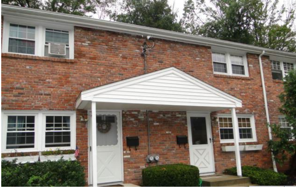
13 Regency Dr U-13 Sale Price = 270,000