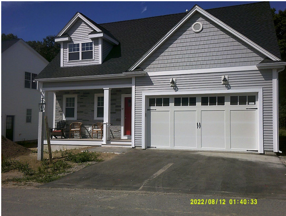
47 Bittersweet Circle Sale Price = 825,000