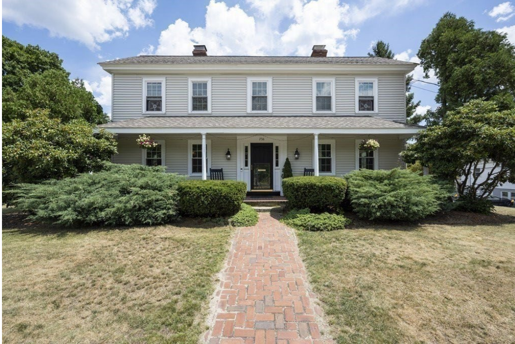
736 Washington St Sale Price = 870,000