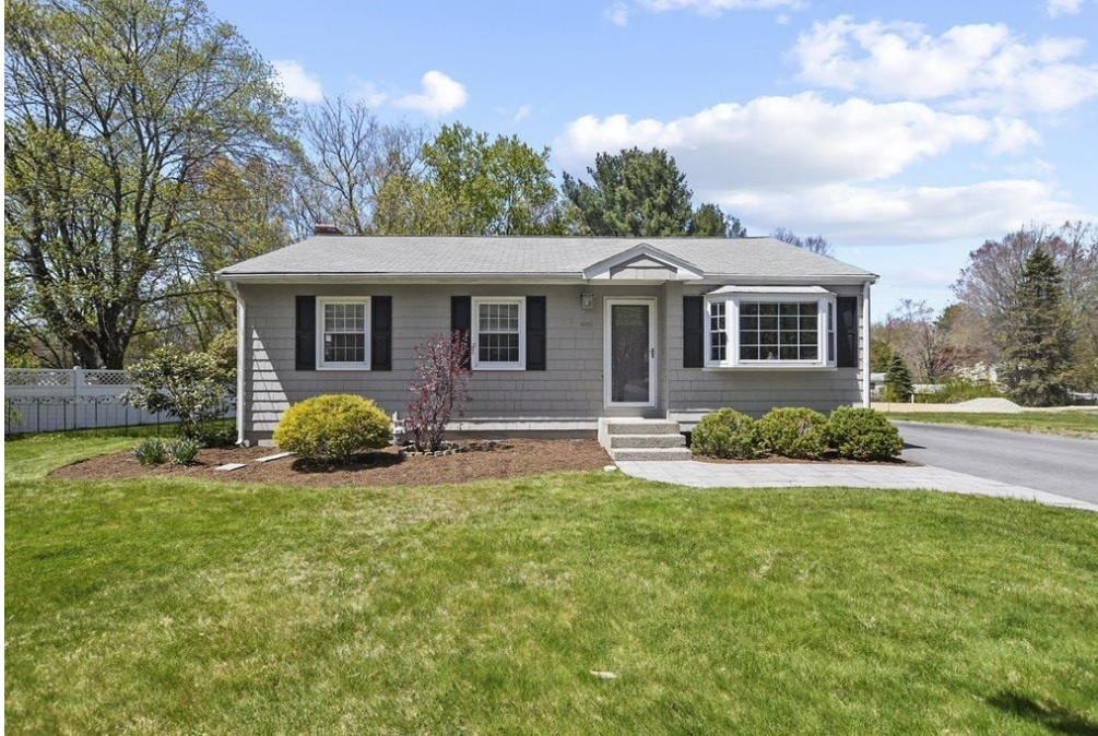
446 Chamberlain St Sale Price = 605,000