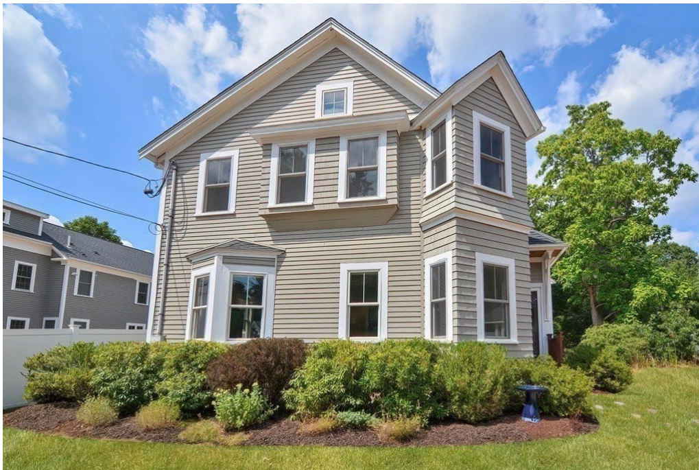
43 Winthrop St Sale Price = 725,000