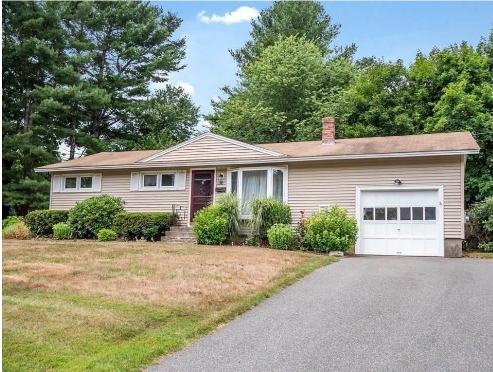
36 Regal St Sale Price = 439,000