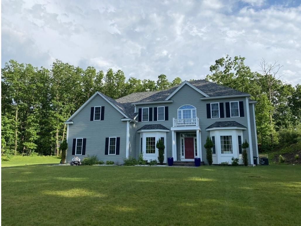
57 Old Cart Path Sale Price = 1,225,000