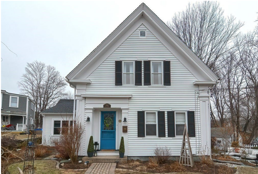
64 Railroad St Sale Price 640,000