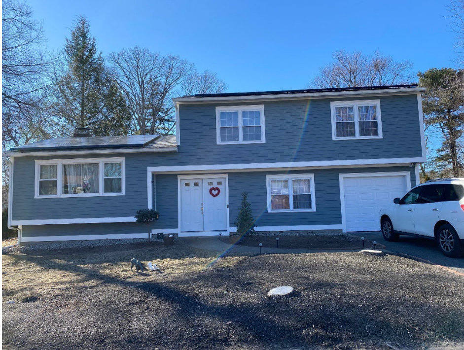
142 Westfield Dr Sale Price = 498,000