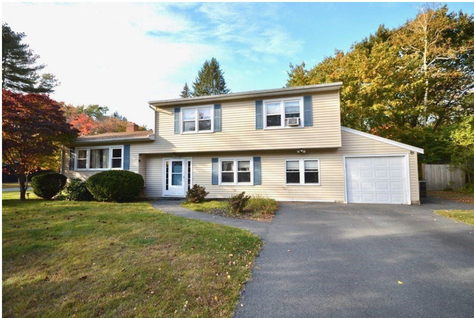
73 Roy Ave Sale Price = 570,000