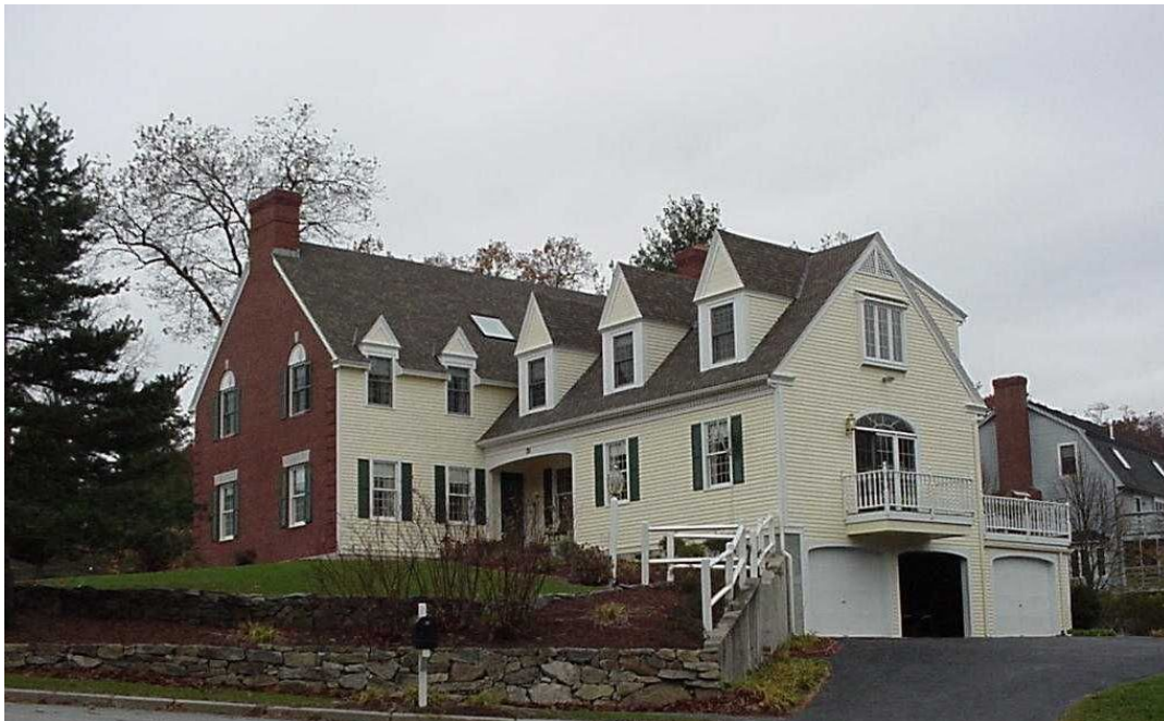
40 Country Rd Sale Price = 875,000