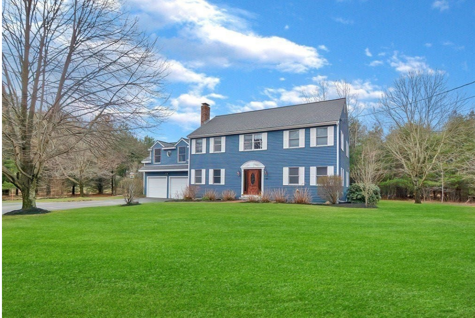
780 Marshall St Sale Price = 965,000