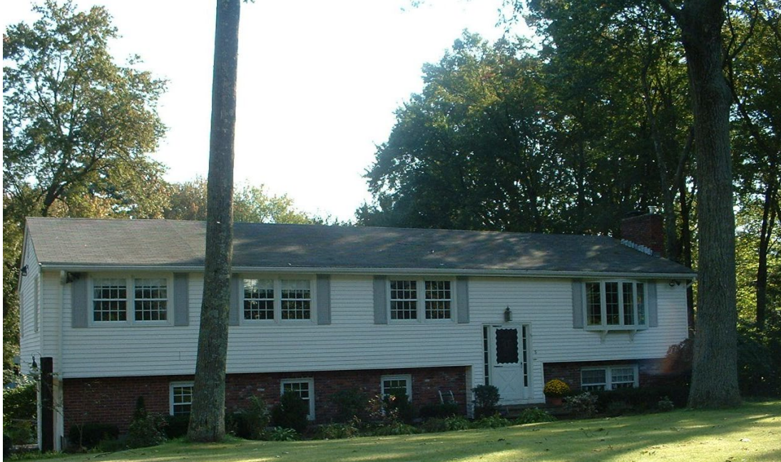
5 Meadowbrook Ln Sale Price = 663,640