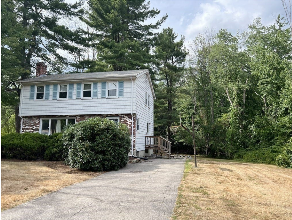
201 Gorwin Dr Sale Price = 440,000