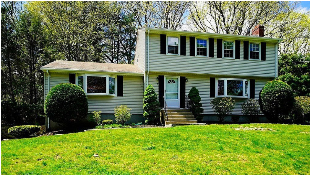
8 Meadowbrook Ln Sale Price = 665,000